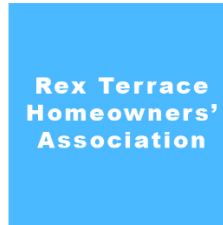
Rex Terrace Homeowners' Association