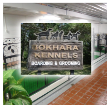
Bokhara Pet Resort