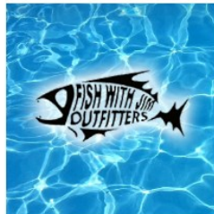
Fish With Jim Outfitters ☎ 231-252-1277 🌐 Visit Website