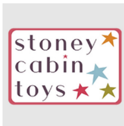
Stoney Cabin Toys ☎ 231-498-5744 🌐 Visit Website