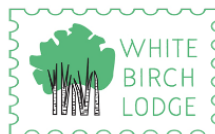
White Birch Lodge