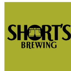
Short's Brewing Company ☎ 231-498-2300 🌐 Visit Website