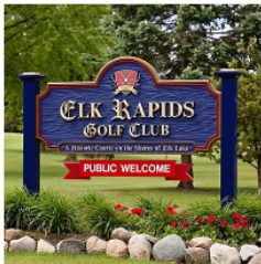
Elk Rapids Golf Club ☎ 231-264-8891 🌐 Visit Website