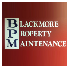
Blackmore Property Maintenance