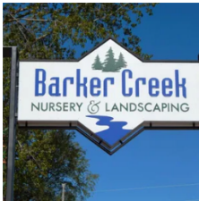
Barker Creek Nursery