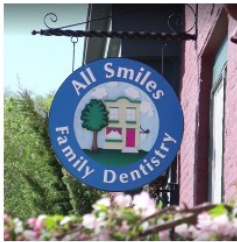
All Smiles Family Dentistry ☎ 231-264-6300 🌐 Visit Website