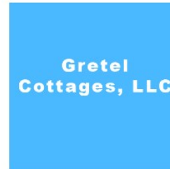
Gretel Cottages, LLC ☎ 231-709-0047